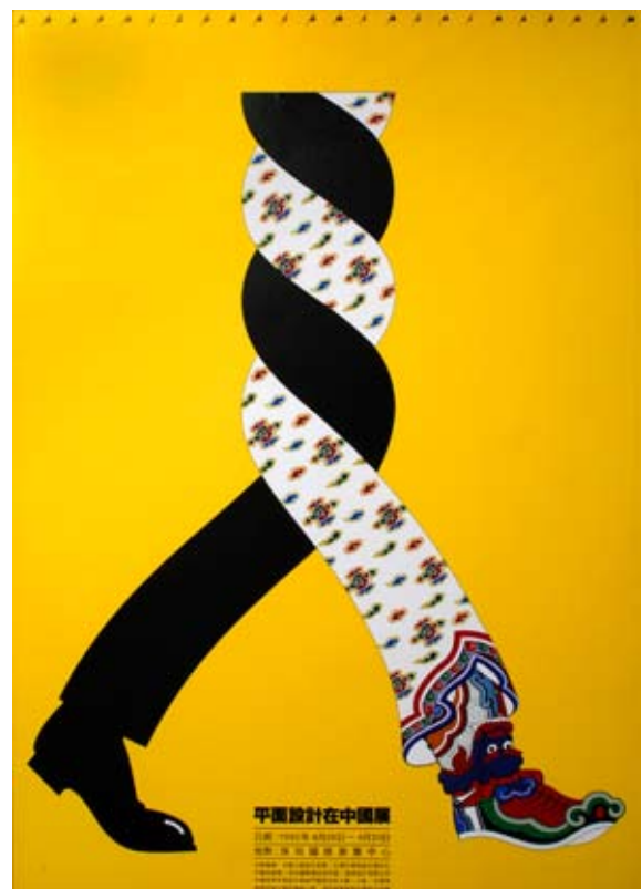
Chen Shaohua Graphic Design in China Exhibition Poster